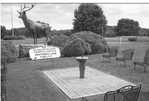
This is the setting of the patio at the front of

the administration building, where the first orders of bricks are being placed.